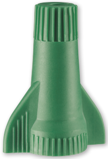
95 Cu to Cu Only