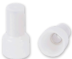
20-089 & 20-090 Cu to Cu Only