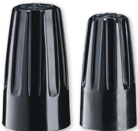
GB-4 Black GB-3 Black Cu to Cu Only